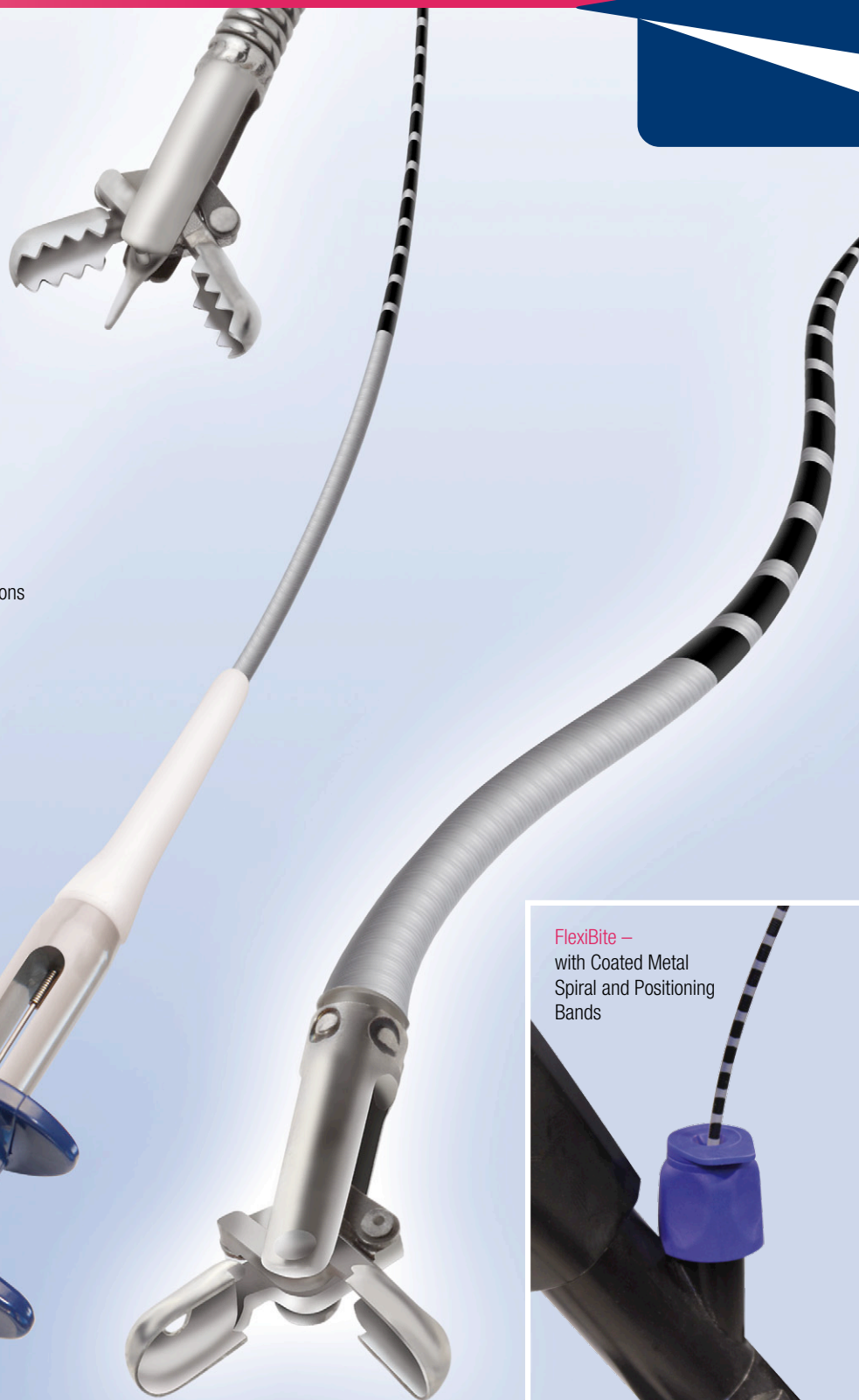
FlexiBite – with Coated Metal Spiral and Positioning Bands