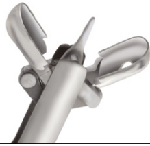
Oval Cups with Spike