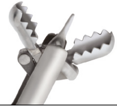
Serrated Oval Cups with Spike