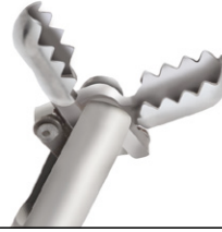
Serrated Oval Cups